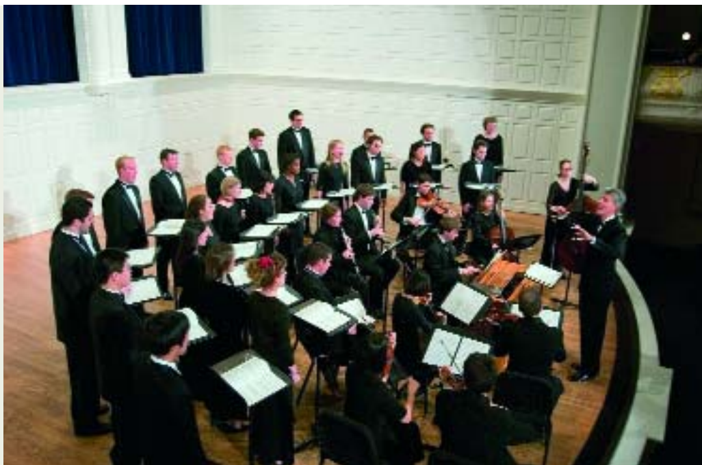
The Schola Cantorum performs with Yale Collegium Players

When aspiring young singers consider formal musical training, they might look to a college specialising in music or to the music department of a large university, where academic research, performance and music-education could be united; though the sine qua non for many still remains the conservatoire or Hochschule, those hallmarks of musical excellence from Naples to Paris, Moscow to London and on to New York. But as we now know them – though tend to forget – these conservatories are largely a 19th-century invention, designed in an era obsessed with the child protégé, whose principal raison d'être was the fostering of solo as well as rank-and-file talent for the burgeoning orchestras and opera houses at the